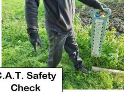
C.A.T. Safety Check