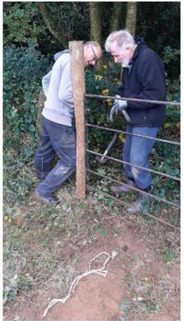
Final tamping down; replacing the soil, post barbed wire and old metal frame