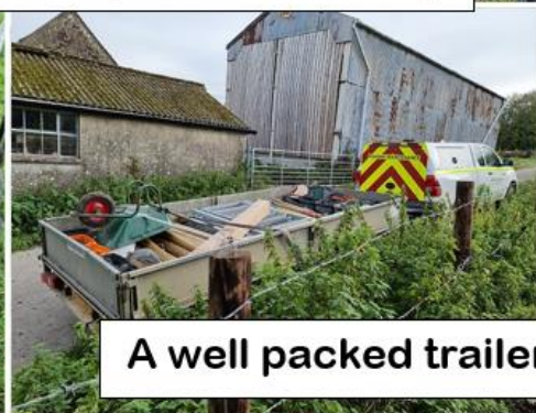
A well packed trailer!