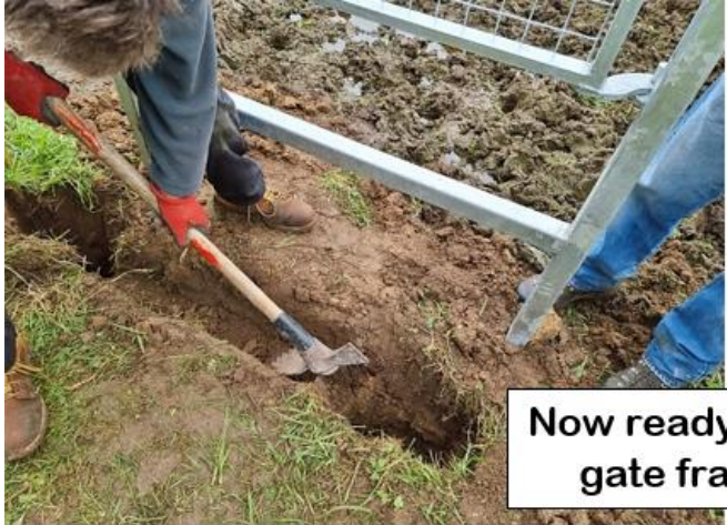
Now ready to drop gate frame in