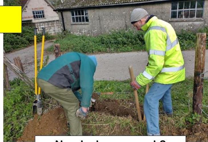
Nearly deep enough?