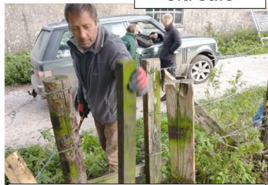
Digging gate foundations