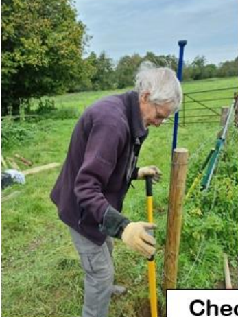
Digging footings for metal gate frame