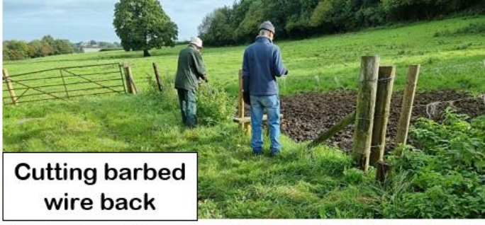
Cutting barbed wire back