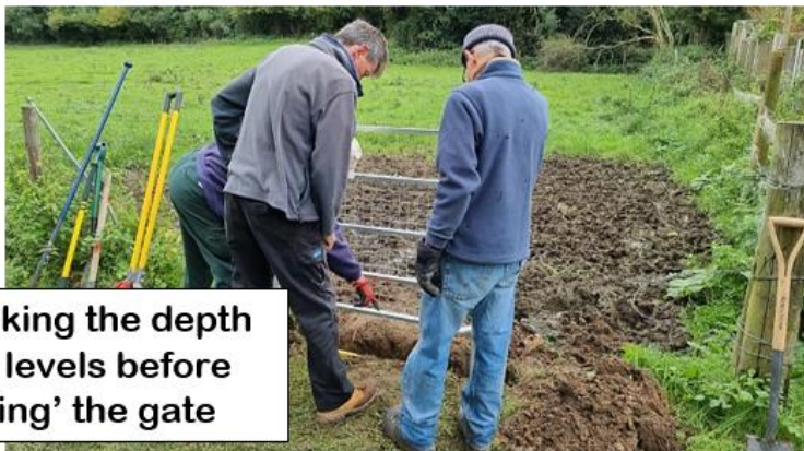
Checking the depth and levels before 'fixing' the gate