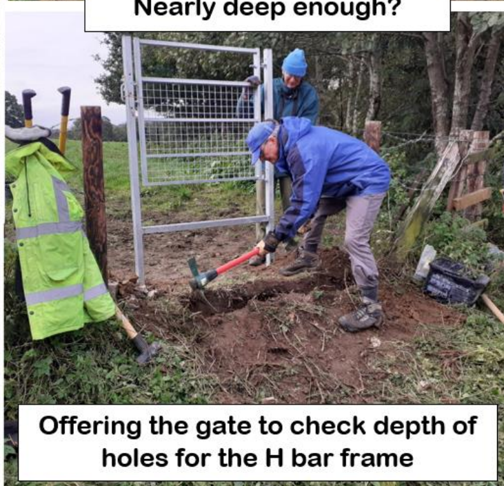
Offering the gate to check depth of holes for the H bar frame