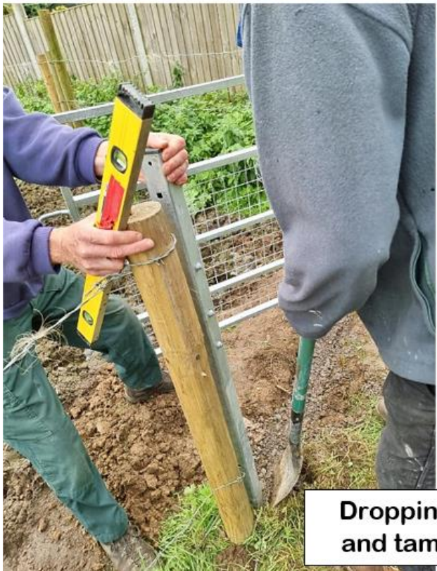
Dropping in the concrete and tamping down firmly