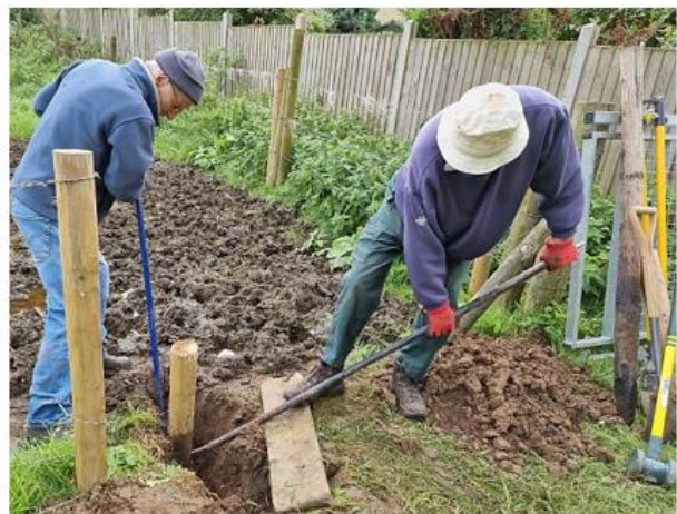
Posts took a time to lever out!