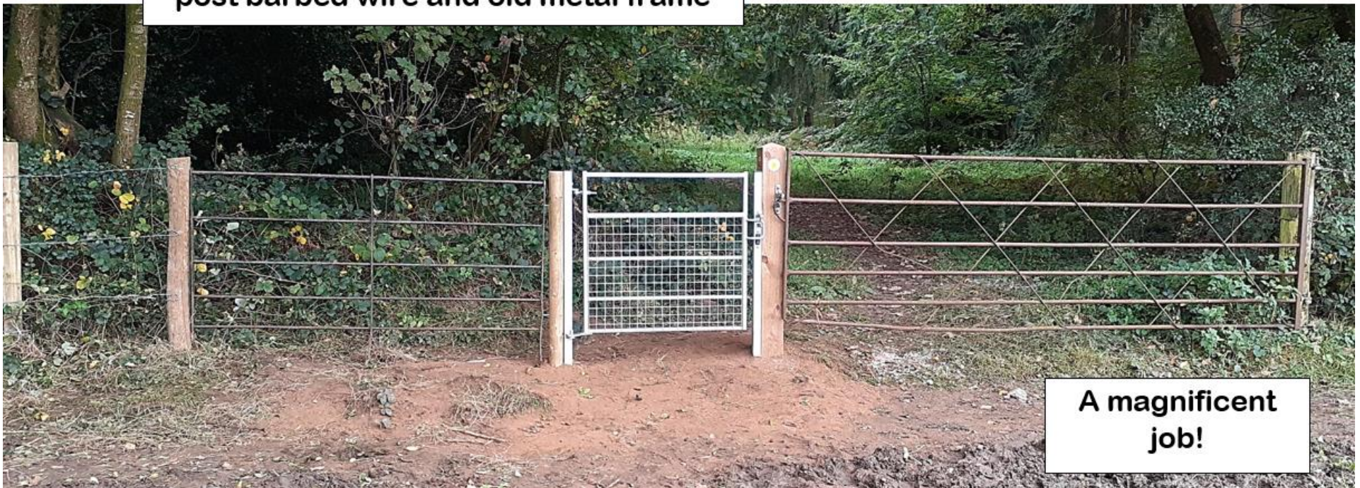
A magnificent job!