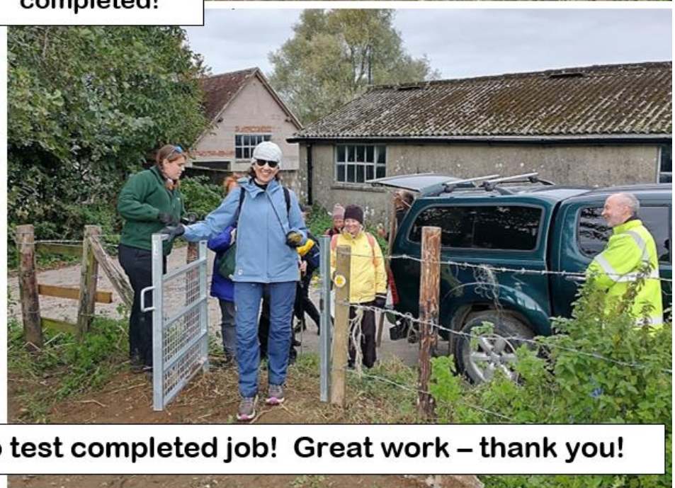
Walkers appear to test completed job! Great work – thank you!