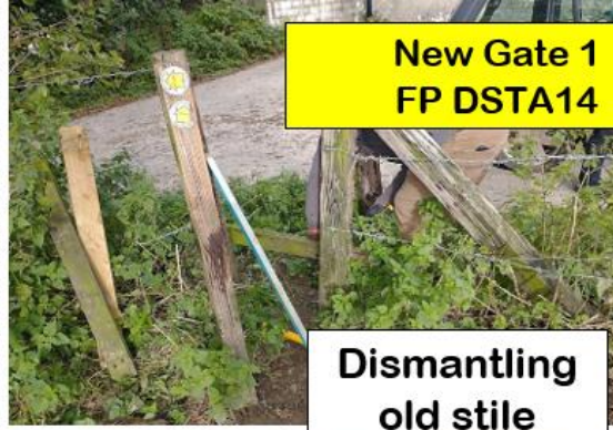
New Gate 1 FP DSTA14