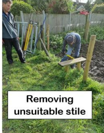
Removing unsuitable stile