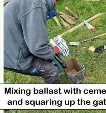
Mixing ballast with cement and squaring up the gate