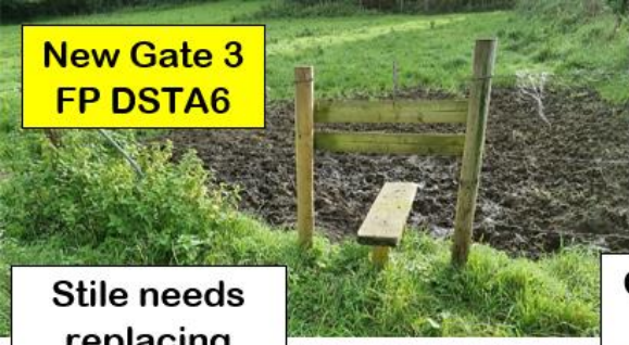
Stile needs replacing