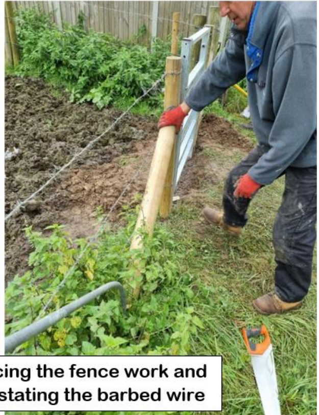
Bracing the fence work and reinstating the barbed wire