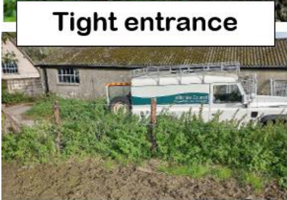
New access for pedestrian gate