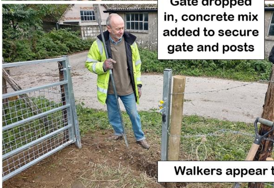
Gate dropped in, concrete mix added to secure gate and posts